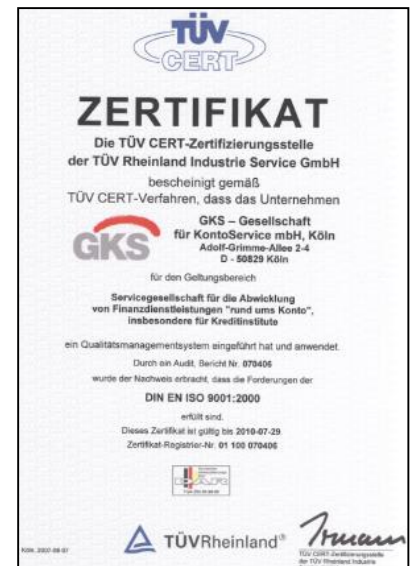
Successfully certification of GKSmbH, Köln to DIN EN ISO 9001:2000